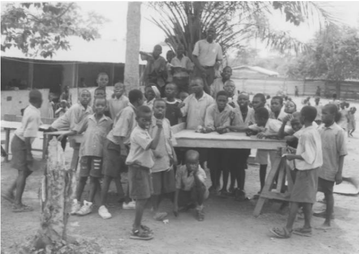
Top: Students gather for a picture.

The cost to send one child to school in Ghana for one year is only $70. If you would like more information on supporting this cause, please contact Augustine Blay at 301-621-8900.