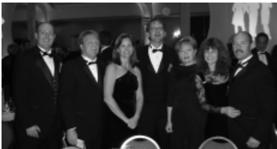
Members of KeyLogic's EPA OCFO BAS team celebrating at the GCN Agency Achievement Awards

BAS also helped the EPA to qualify as a finalist for the 2002 Presidential Quality Award and to win the 2003 Presidential Quality Award for Management Excellence, in the area of Improved Financial Performance. As a direct result of KeyLogic's BAS support, EPA was honored with a 2004 GCN magazine Agency Achievement Award for using innovative technologies to create superior results for their agency and its constituents.