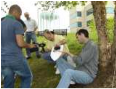
Employees in the DC Metro Area celebrated with an afternoon of fishing and remote control boats in the lake behind the office.

KeyLogic was founded in 1999 and has since achieved eight consecutive years of growth. A prime on nearly 75% of its contracts, KeyLogic attributes its success to its enthusiastic and experienced staff of professionals dedicated to innovative thought, proactive solutions and top-notch customer service.