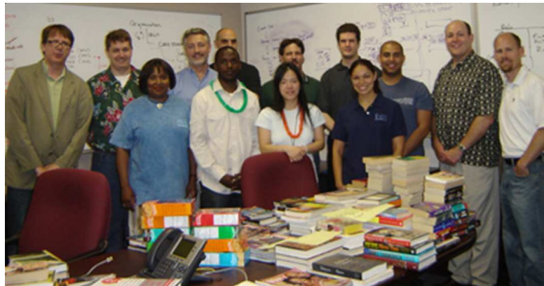
Employees were eager to participate in another book drive for our nation's troops - this is just one of the locations where books were sorted, packed and shipped.