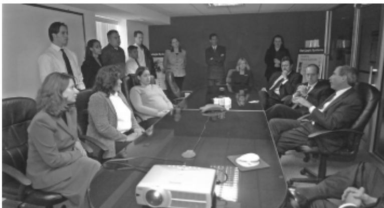
Governor Wise met with the staff of KeyLogic's Corporate office to discuss the issues surrounding the expansion of the technology sector and the jobs it has created within West Virginia and the U.S. government.